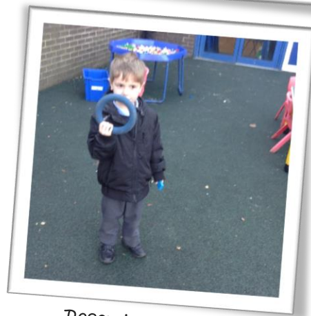
Reception learnt about shapes this week