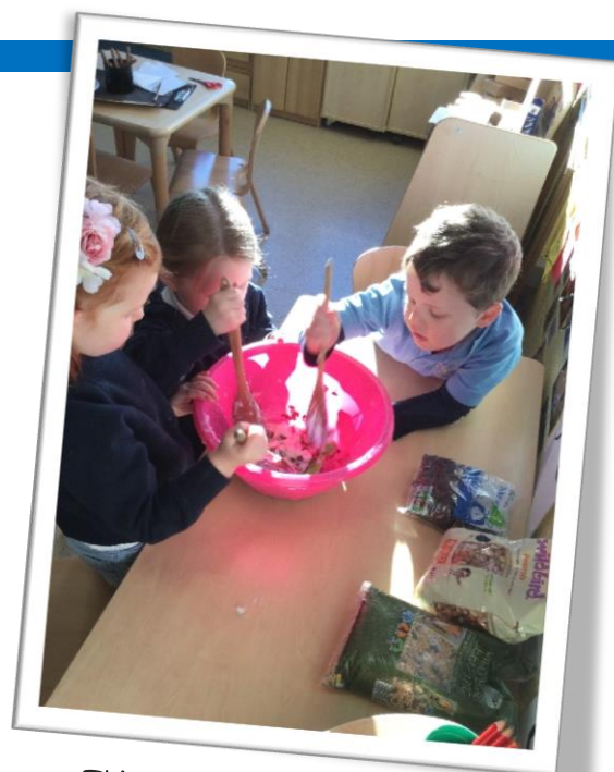
This week Early Learners have been making bird feeders.

Your money will go to Save The Children which will help give children from Surkhet district, mid-Western Nepal, access to after school clubs which help to educate them about the dangers of child marriage. It could also help bring essentials like healthcare, education, protection and food to the millions of children around the world who are missing out on the most basic support.