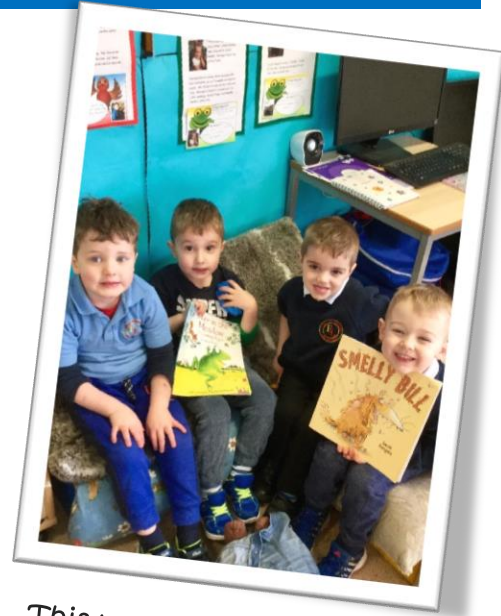
This week in Early Learners we have been playing rhyming games and listening to rhyming stories.

We are constantly trying to find activities to encourage local participation and helping the community to grow, not just grow from the point of view of growing fruit and vegetables, but growing socially, and educationally etc. too.