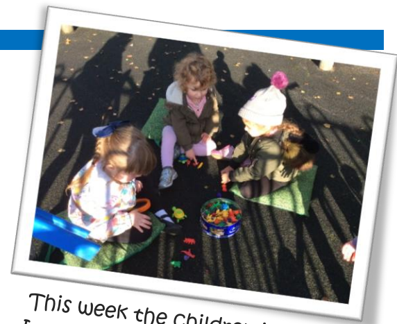
This week the children in Early Learners have been sharing and counting out toys with their friends.