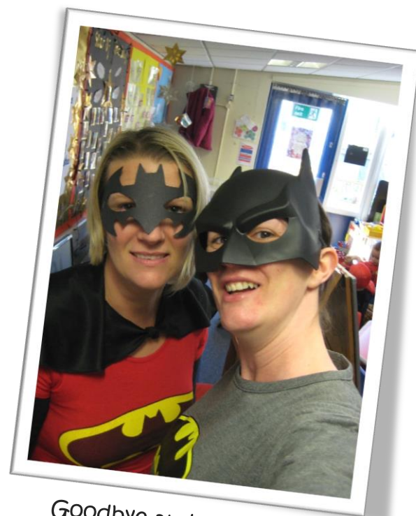
Goodbye and Good Luck