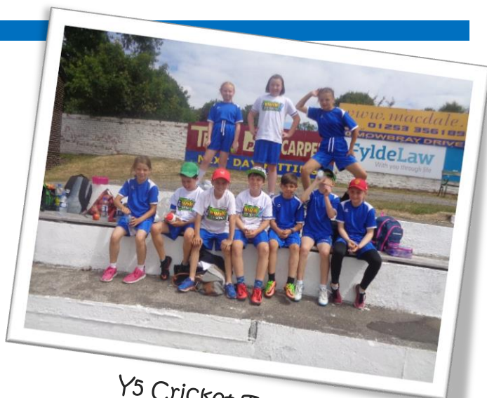
Y5 Cricket Team

Year 1 have won the Class dojo award again – the only class to have won it twice! They will choose their reward next week.