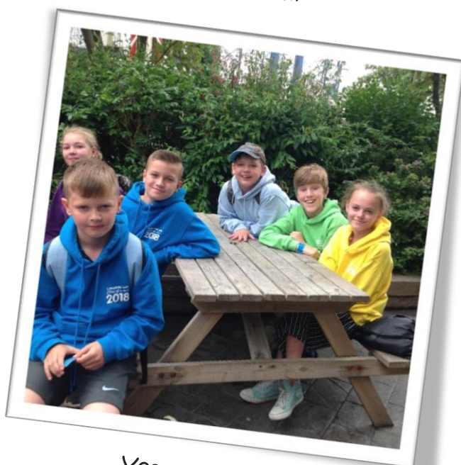
Year 6 at Blackpool