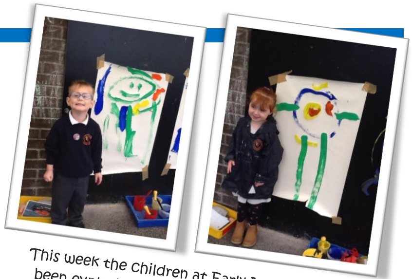
This week the children at Early Learners have been exploring mark making on a large scale.