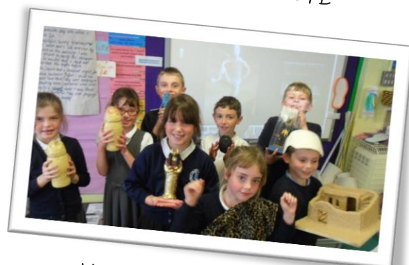
Year 3 learning about Ancient Egypt