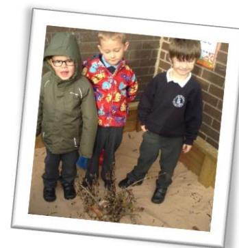
Reception enjoying the Autumn days

We have been informed that there is a number of alternative browsers which are available for trial/download which will allow full access to all of the Mathletics/ Spellodrome features, for example Photon Browser and Puffin Browser . Alternatively, your child can visit Homework Club during Monday lunch times.