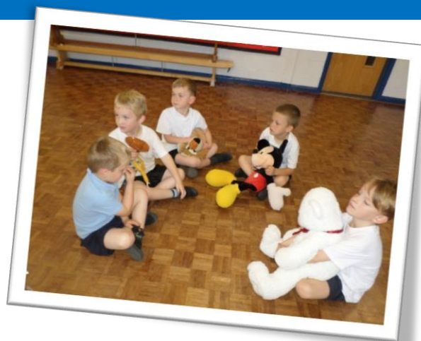
Year 1 brought their teddies to PE

Please see attached flyer for details about Cricket Academy starting at Welfied High School for ages 9 – 14.