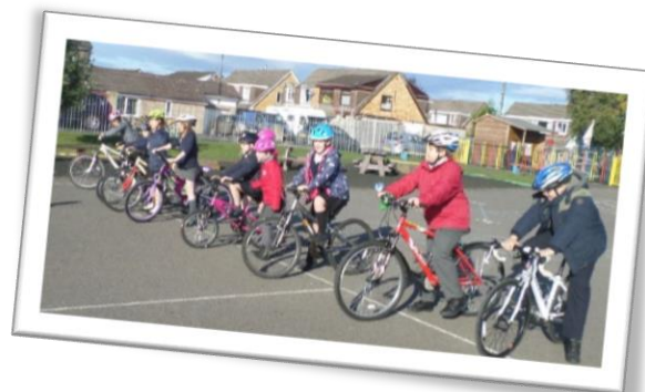
Year 6 Bikeability