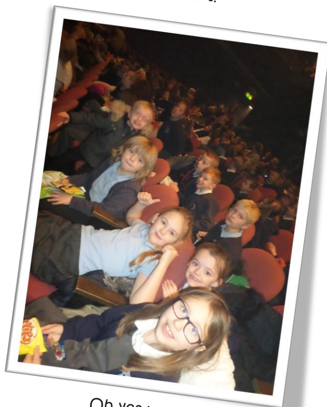
Oh yes we did!