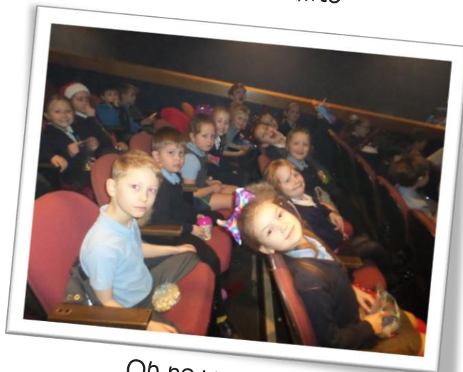
Oh no we didn't!