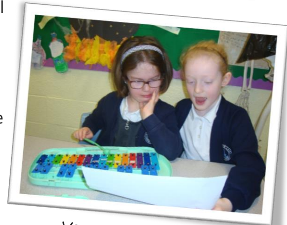
Year 3 learning a song about Fair Trade