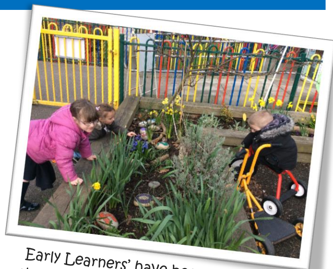
Early Learners' have been observing the growth of the spring bulbs which we planted last year.