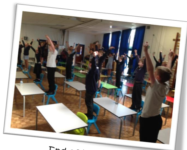
End of KS2 SATs