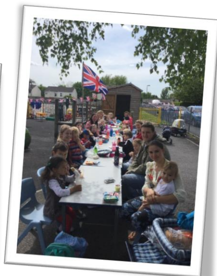
Early Learners enjoyed a picnic lunch to celebrate the Royal Wedding.