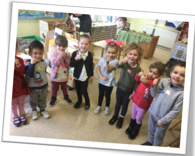
The children in Early Learners are very proud of their fantastic phonic work.

Breakfast club - 7.45am-9am, Mornings - 9am -12pm Lunch - 12pm - 12.30pm, Afternoons - 12.30pm - 3.30pm. Stoppers - 3.30pm - 5.45pm (for children aged 3 and over).