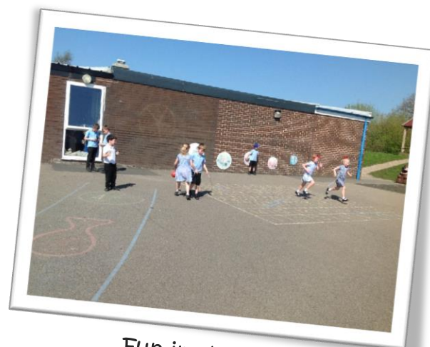
Fun in the Sun!