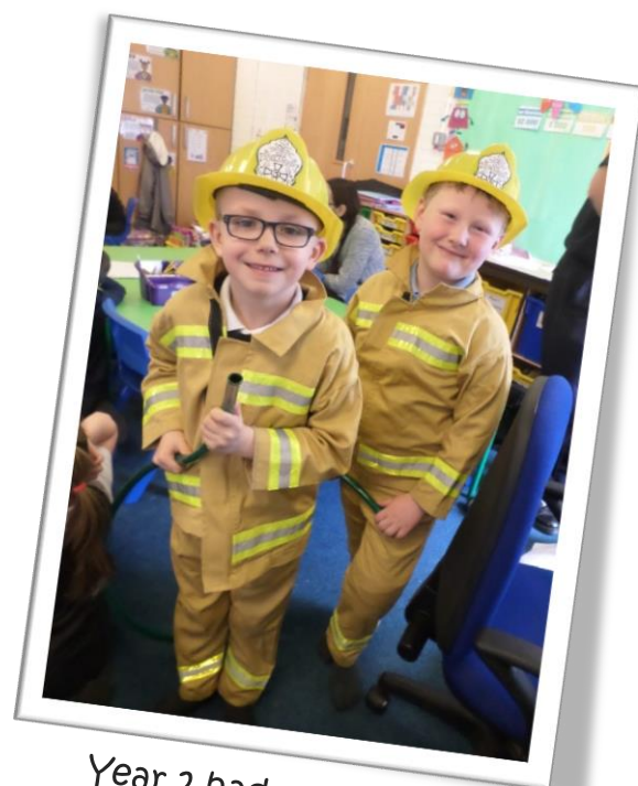
Year 2 had a visit from the Fire Service