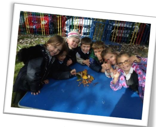
Year 1 Science