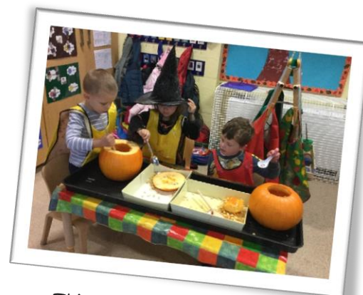
This week Early Learners have been preparing for Halloween and making potions in the mud kitchen.