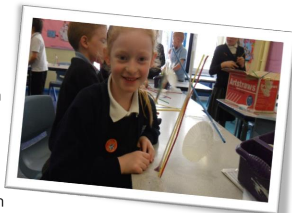
Year 3 making Shaduf models

On Thursday 27 th October 9am-11am Early Learners is holding a Stay and Play session for parents and children. The aim of this session is to look closely at the learning area - Understanding of the World. We will be going on a treasure hunt in the local area. Everyone welcome.