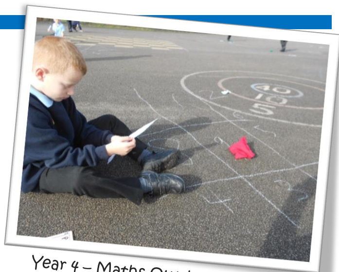
Year 4 - Maths Outdoor Learning