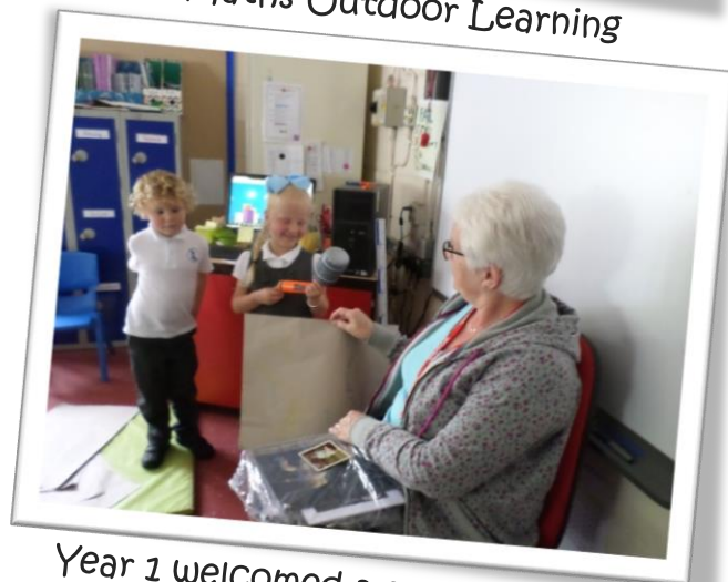
Year 1 welcomed a special visitor