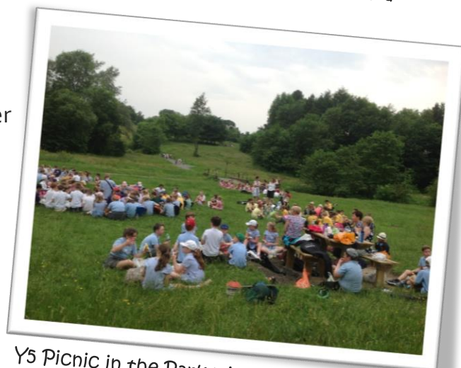
Y5 Picnic in the Park with other local schools.