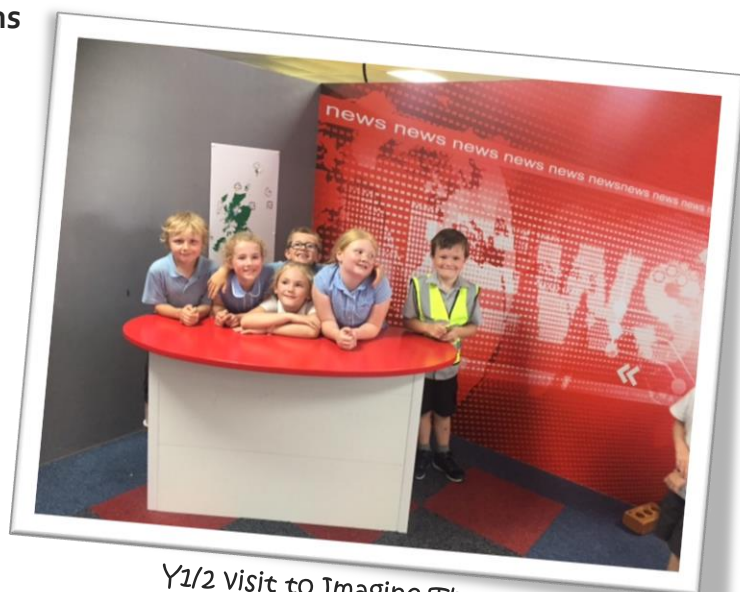
Y1/2 visit to Imagine That