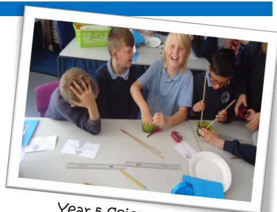
Year 5 Science Lesson