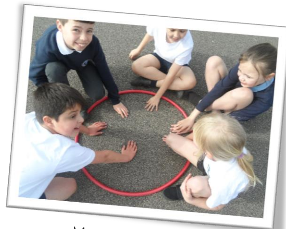
Year 4 Orienteering Lesson in PE