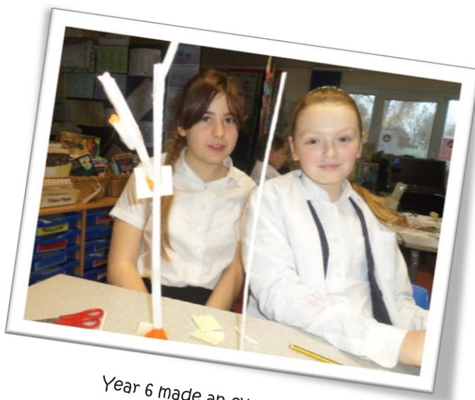
Year 6 made an evolution tree