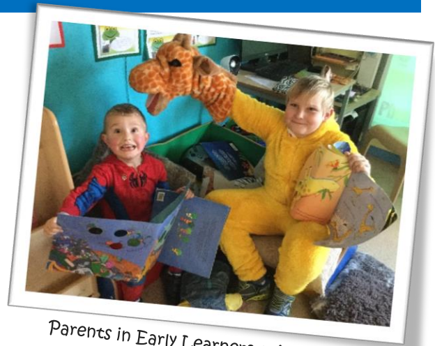
Parents in Early Learners enjoyed a stay and play session based on maths.