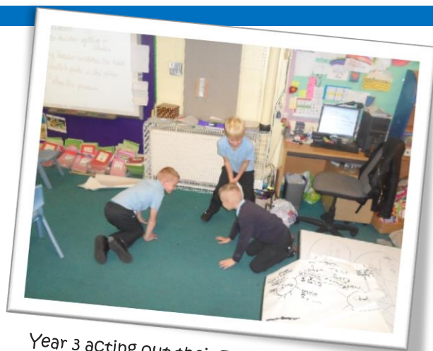
Year 3 acting out their Funny Bones stories.

Y2 were invited to visit the new homes on Wigan Road as part of their materials project in science. Their behaviour was exemplary and the children asked very thoughtful and sensible questions. Well done Year 2.