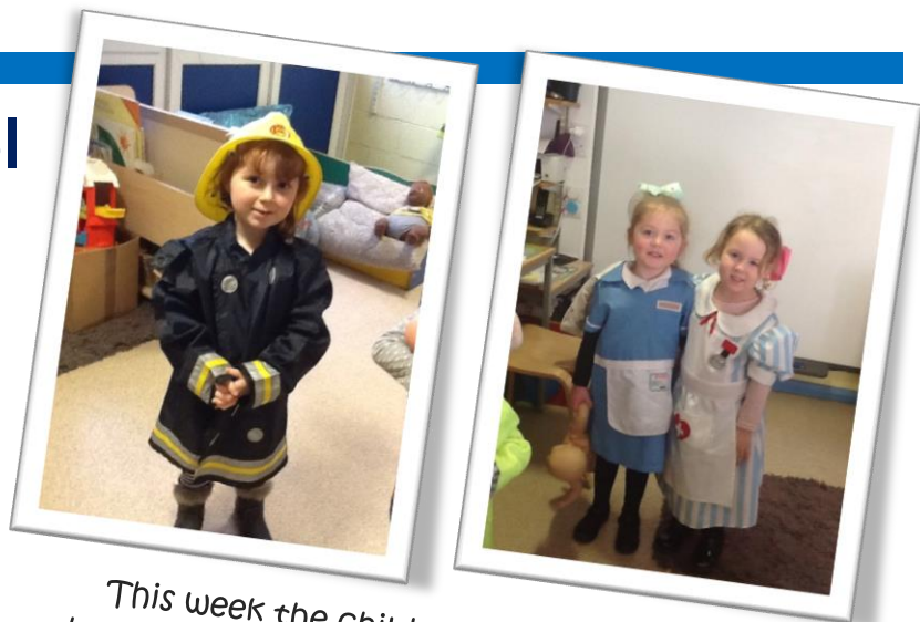
This week the children at Early Learners have been learning about people who help us.