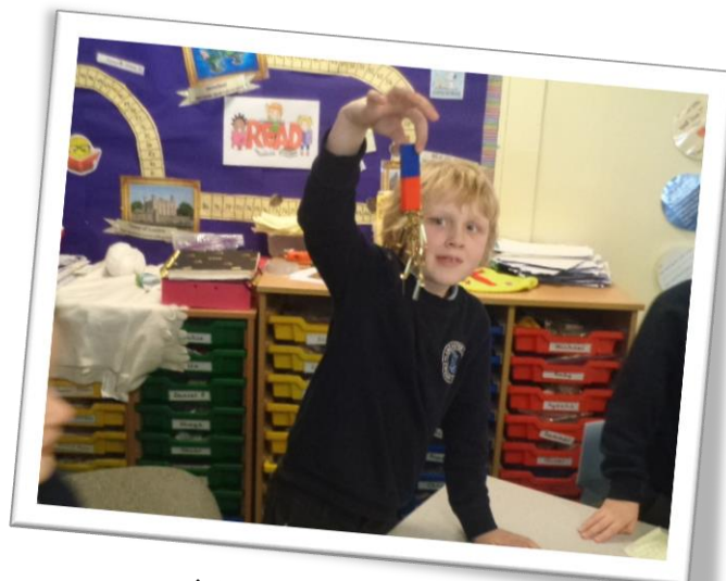
Year 3 investigating magnets in science.