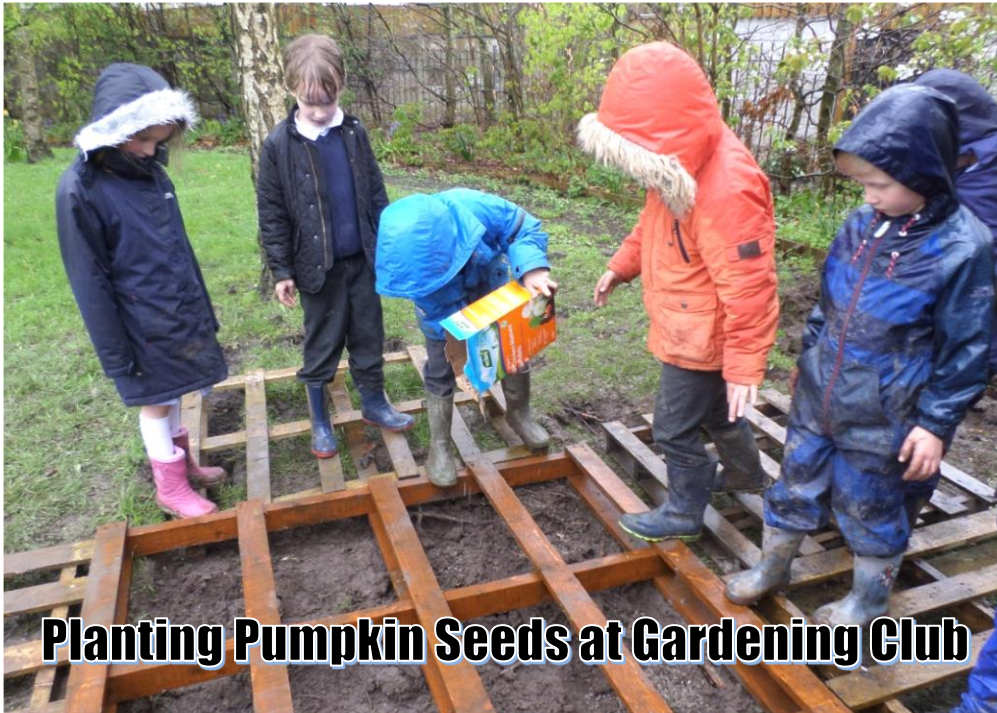
Planting Pumpkin Seeds at Gardening Club