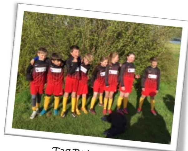
Tag Ruby Team