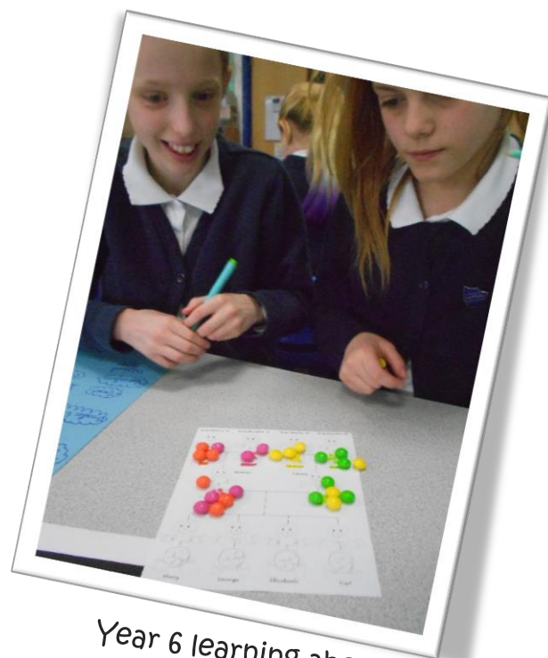
Year 6 learning about evolution in Science.