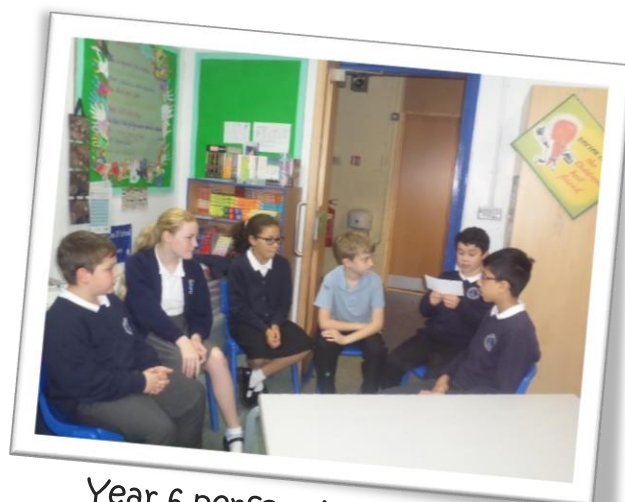
Year 6 performing a Neville Chamberlin speech as role play