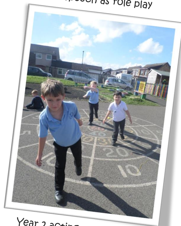
Year 2 acting out their own board games