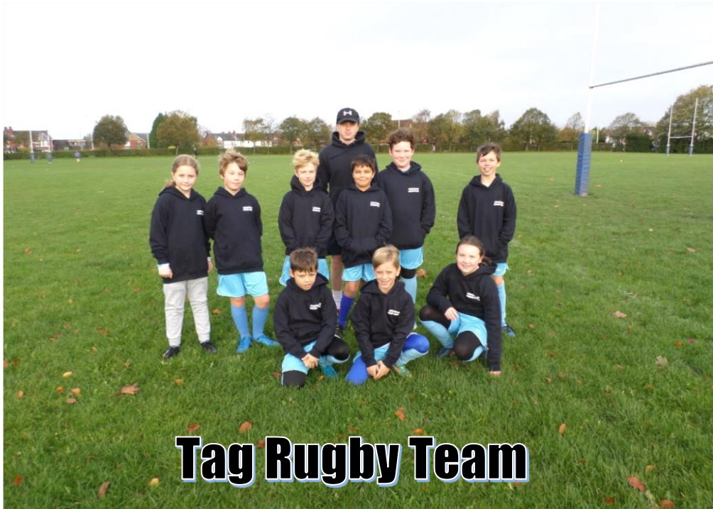
Tag Rugby Team